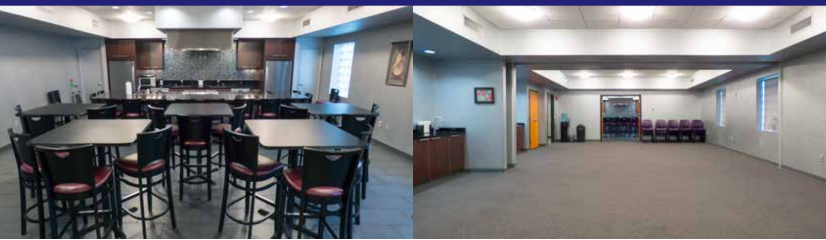
EXAMPLE SETUPS PICTURED BELOW • RENTAL DOES NOT INCLUDE DECORATIONS