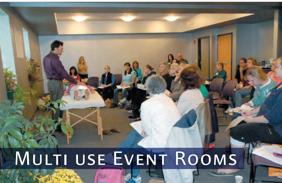
MULTI USE EVENT ROOMS